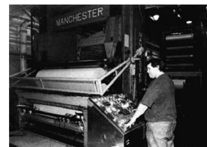
FiberMark's headquarters and Technical products division are located near Wellington Rd.