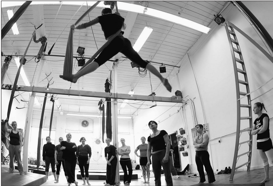
Nimble Arts Trapeze and Circus School was the winner of the 1st Annual Business Plan Competition.